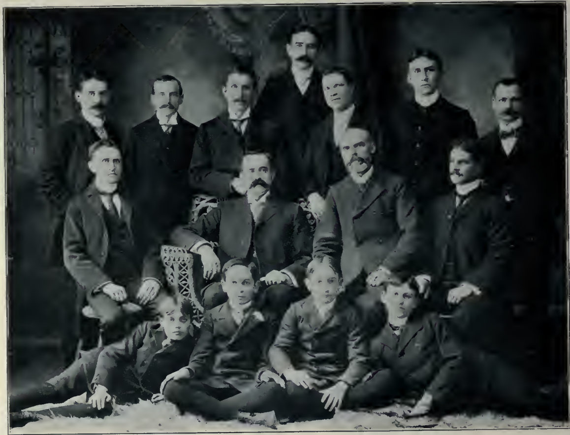
CHURCHWARDENS AND SIDESMEN, With Boy Collectors of Hymn and Prayer Books.