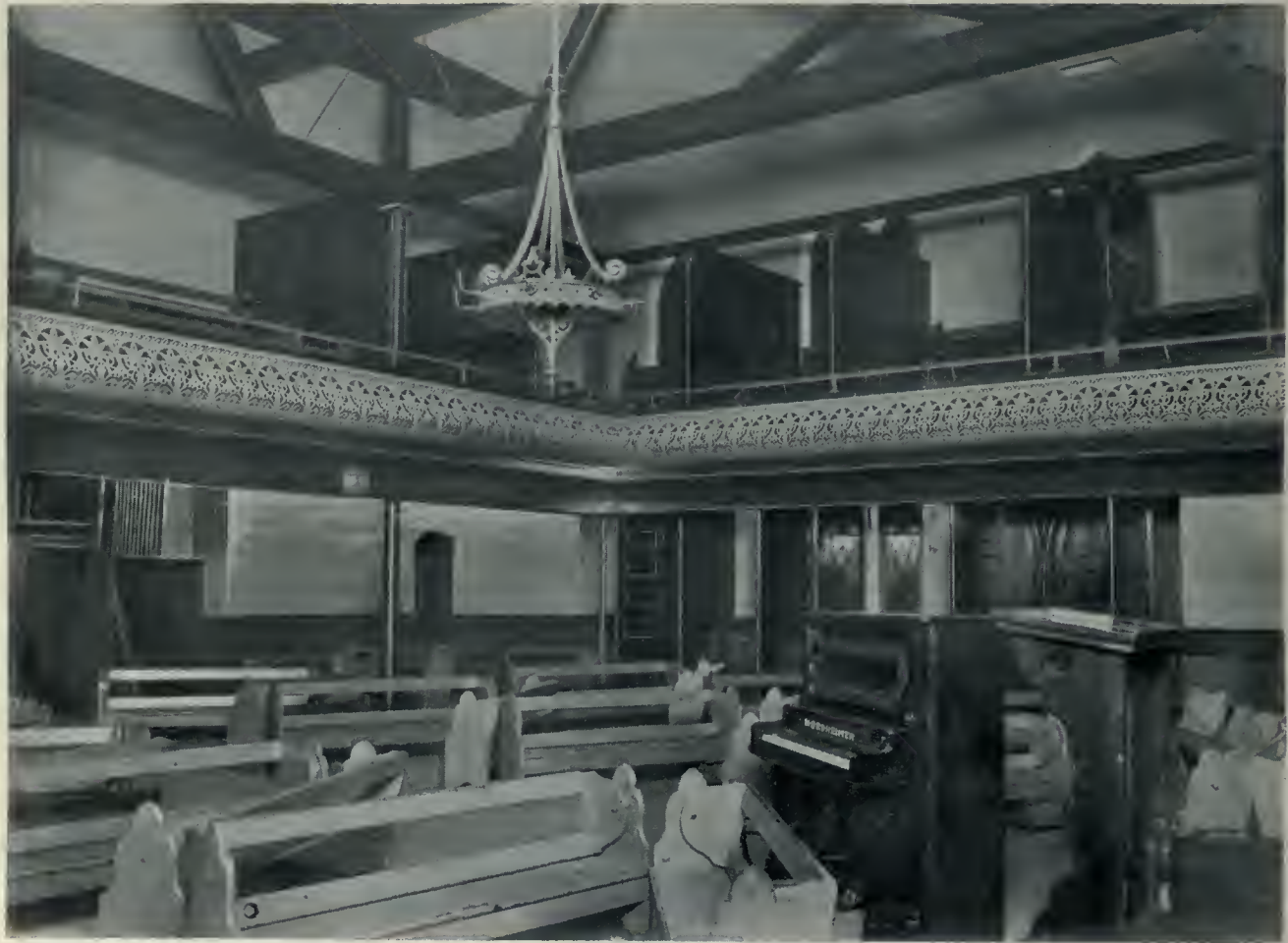
SECTIONAL VIEW, INTERIOR OF SUNDAY SCHOOL.