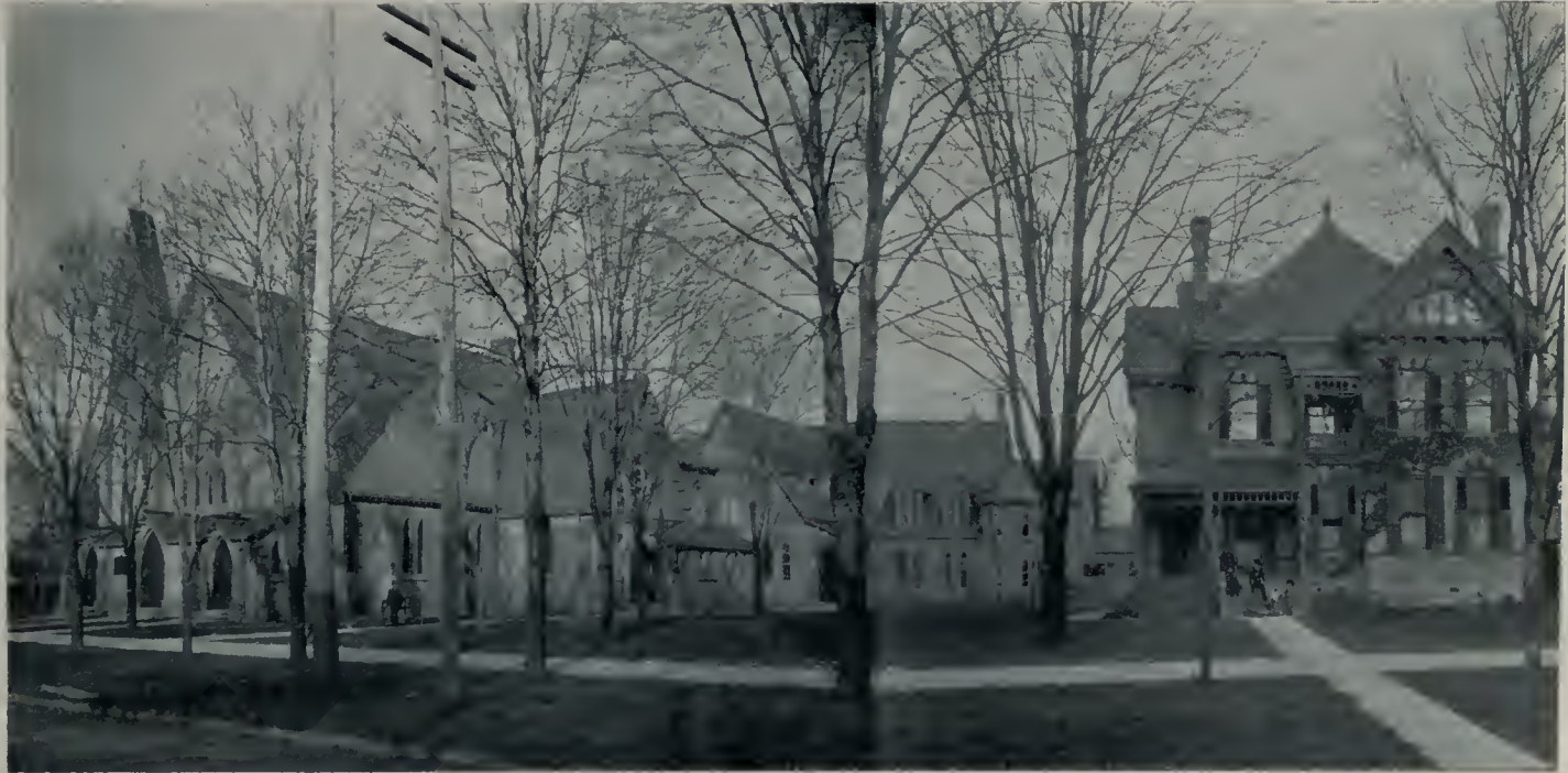
THE CRONYN MEMORIAL CHURCH, SUNDAY SCHOOL AND RECTORY, LONDON, ONTARIO, CANADA.