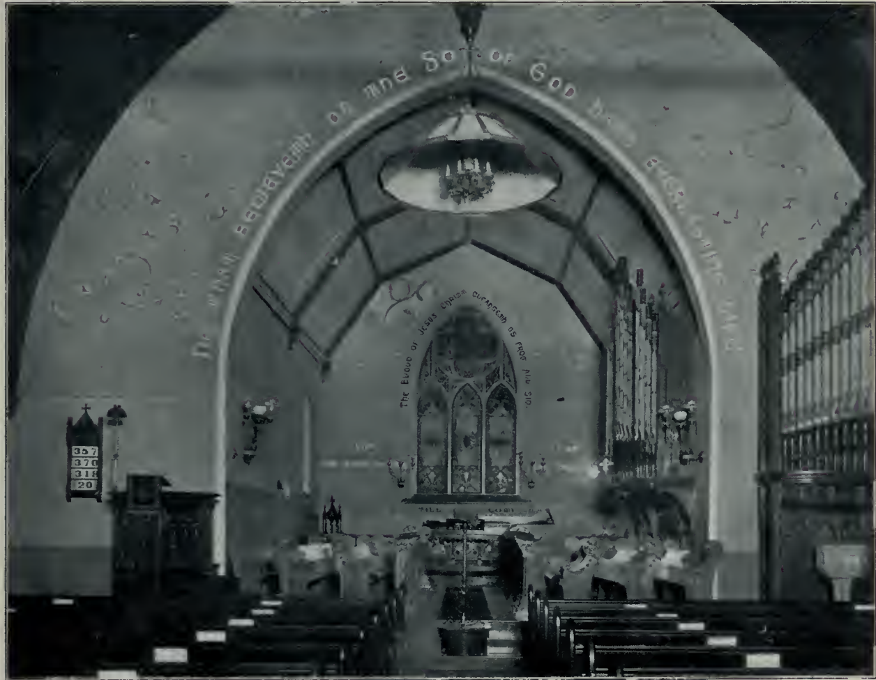
INTERIOR VIEW OF CHURCH, SHOWING CHANCEL.